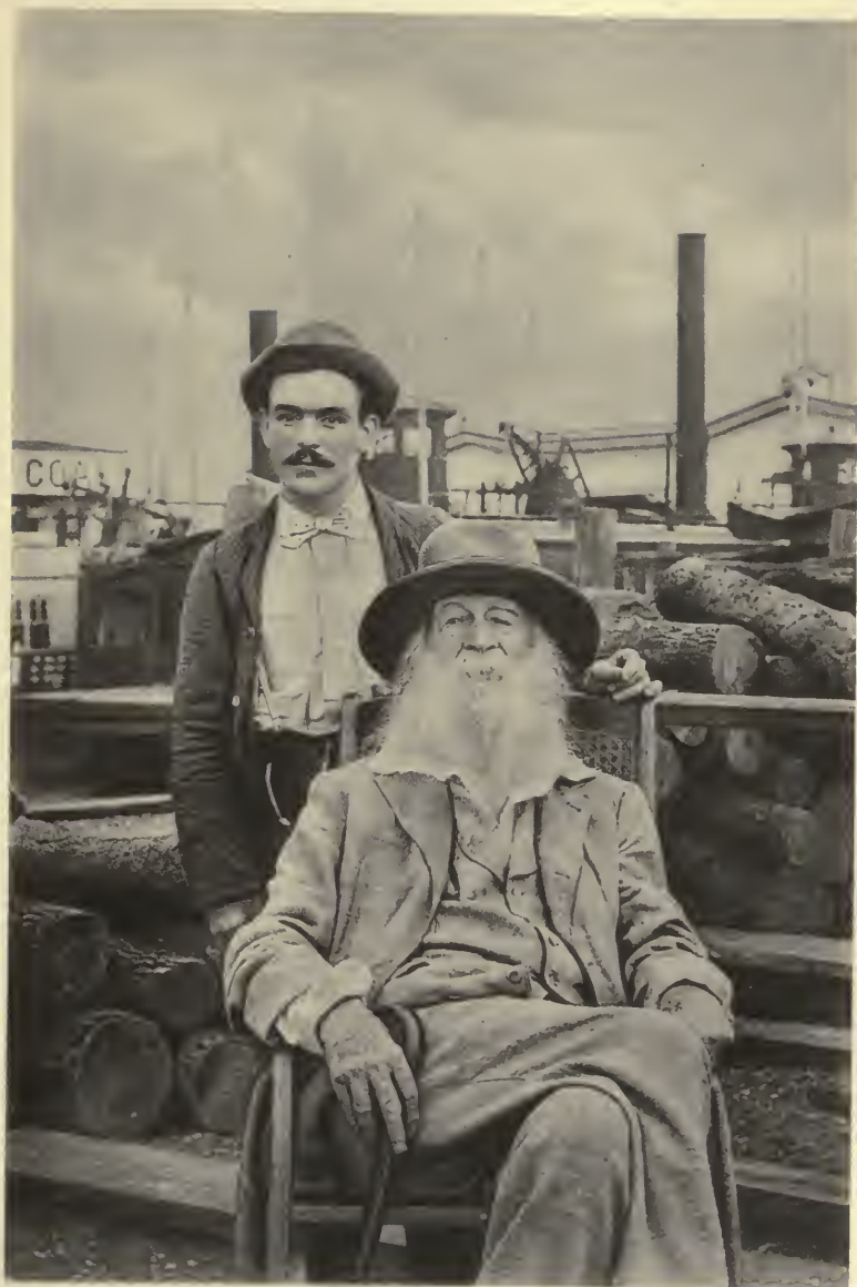
WALT WHITMAN ON THE WHARF AT CAMDEN, NEW JERSEY, JULY 1890.